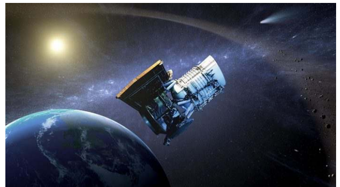
Artist's concept of The Wide-field Infrared Survey Explorer (WISE) spacecraft