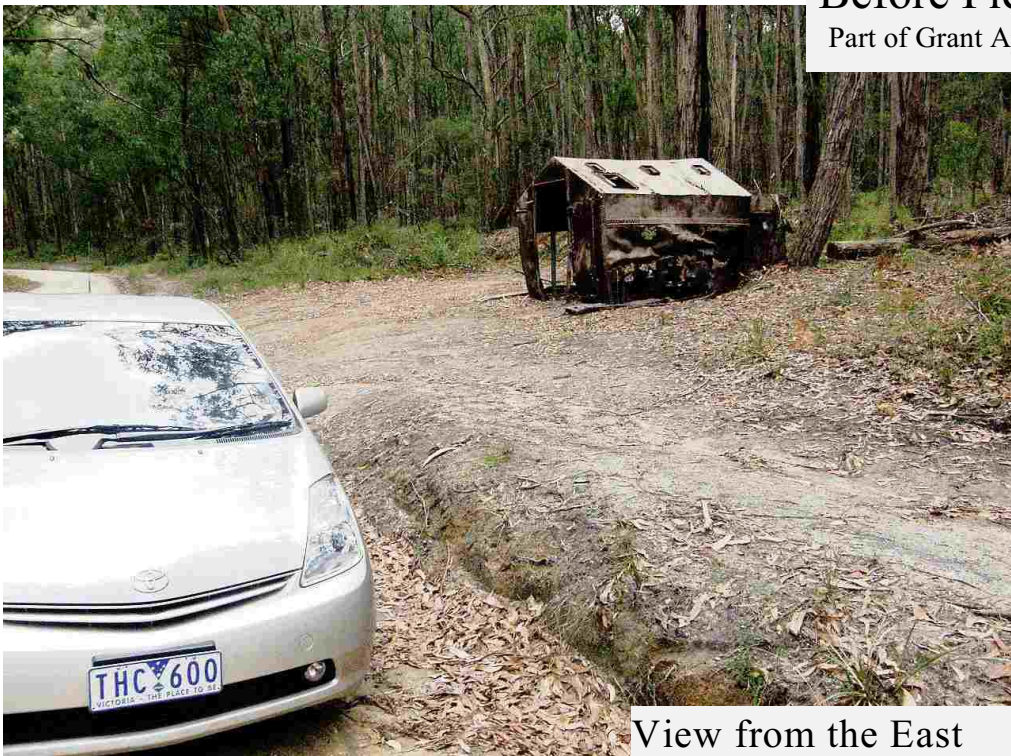
View from the East