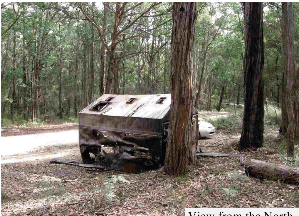
View from the North